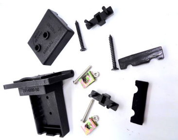
SCREWS LOCKING TABS SPEED CLIPS RUBBER SEALS