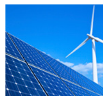
Renewable Energy Systems