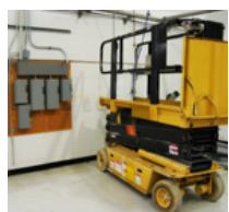
Aerial Work Platform